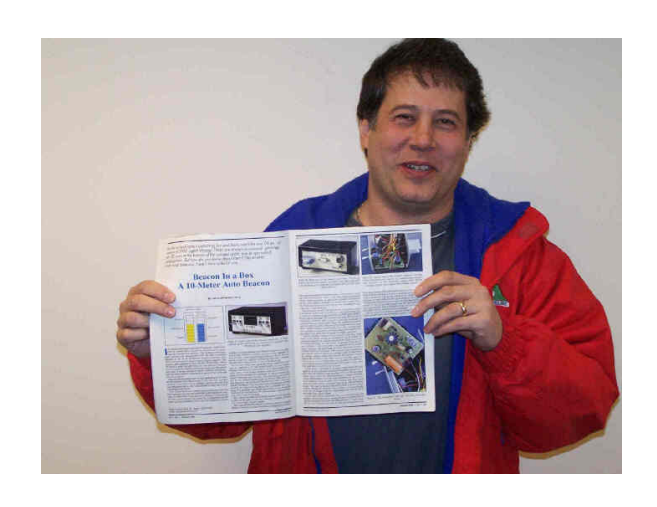
Beacon in a Box (repeat)